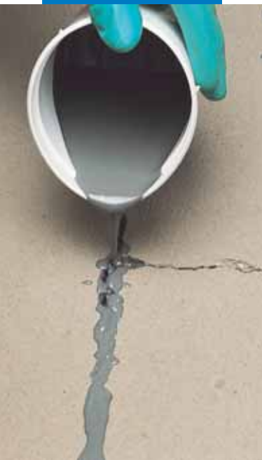
Repairing a crack in cement screed with Eporip