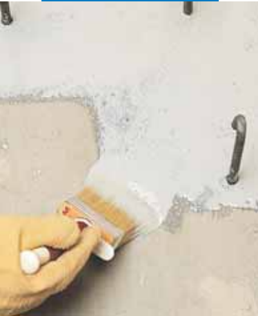
Applying Eporip by brush on construction joint