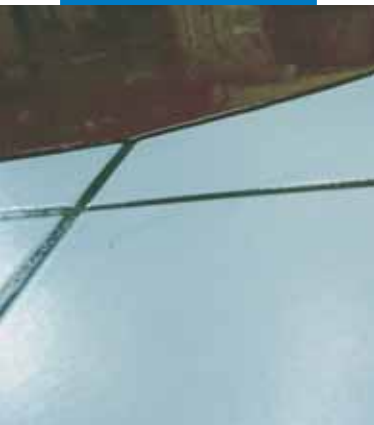
Detail of the application of Ultraplan on an existing ceramic tile floor after the application of Mapeprim SP