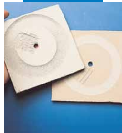
Taber abrasion executed on Ultraplan (right specimen) and on conventional levelling (left specimen) after 200 cycles