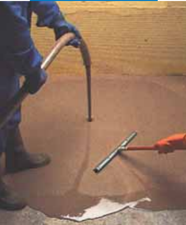
Application of Ultraplan with pump and squeegee