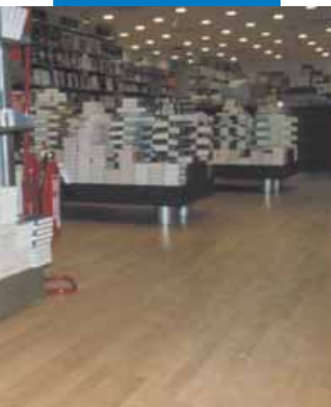
An example of an installation of wood on a surface levelled with Ultraplan - Messagerie Musicali - Rome - Italy