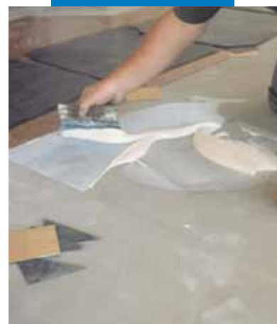
An example of an installation of inlaid PVC on a surface levelled with Ultraplan - CD2 - Milan - Italy