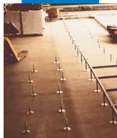
Slab levelled with Ultraplan ready for fixing a floating floor