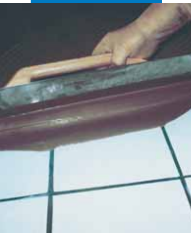
Application of Ultraplan with a metal trowel on an existing ceramic tile floor after the application of Mapeprim SP