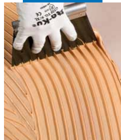
Excellent workability and rib stability