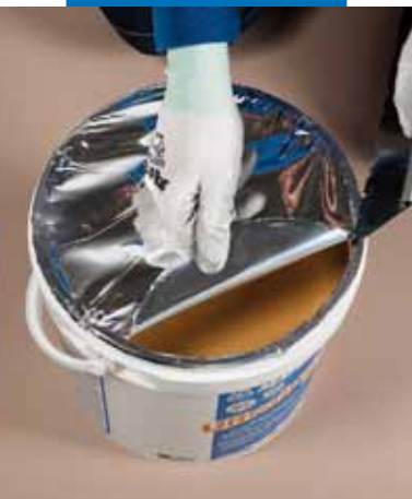
Easy and fast removal of the sealing film