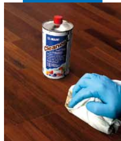
Cleaning large format of pre-finished parquet with Cleaner L