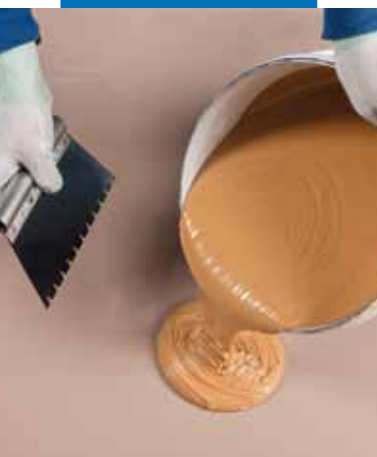
Excellent keeping and stability of the product