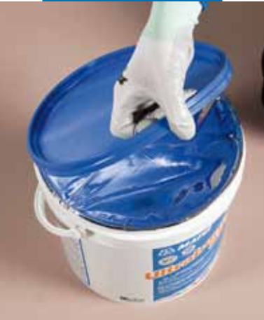
Easy opening of the bucket

Although the technical details and recommendations contained in this product