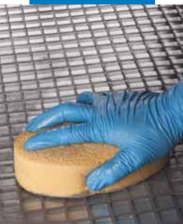
Final rinsing with a sponge