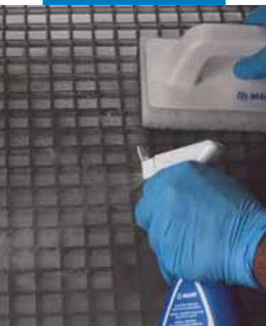
Spraying Kerapoxy Cleaner on the surface requiring cleaning