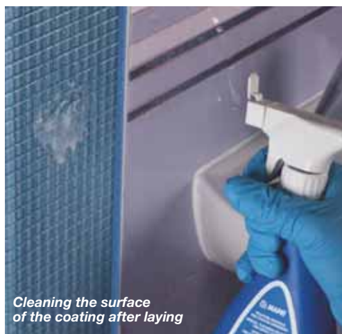
Cleaning the surface of the coating after laying

All relevant references for the product are available upon request and from www.mapei.com