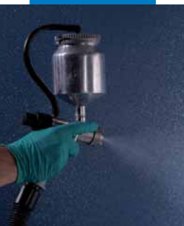
Finishing off Silancolor Tonachino with Mapelux Lucida and MapeGlitter Silver